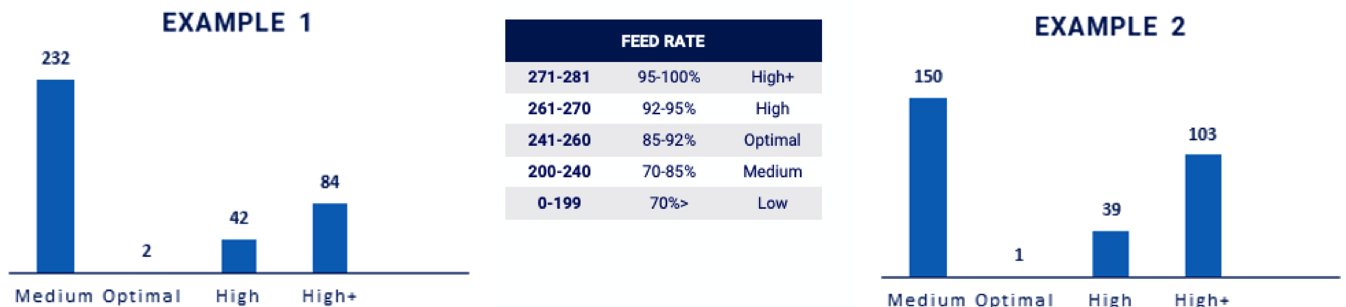
Graph 1 & 2. Secondary Air Temp Increase °F with Petuum Optimum for Different Production Levels

Taking a closer look at the energy recovery gains, available during different operating conditions in Graph 3 and 4, you will observe that Petuum Optimum provides the most opportunity for optimization while the asset capacity is above or slightly below the optimal feed rate.